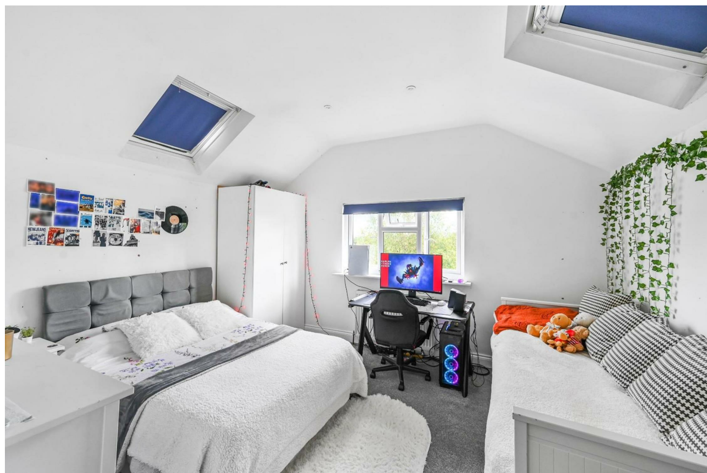
Bedroom Two 13'5" x 11'5" (4.10 x 3.50) Window to rear aspect, two Velux windows.